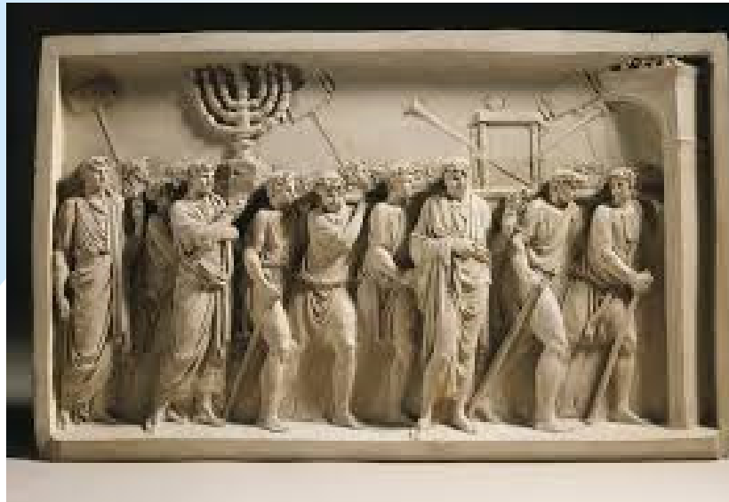
spoils of war