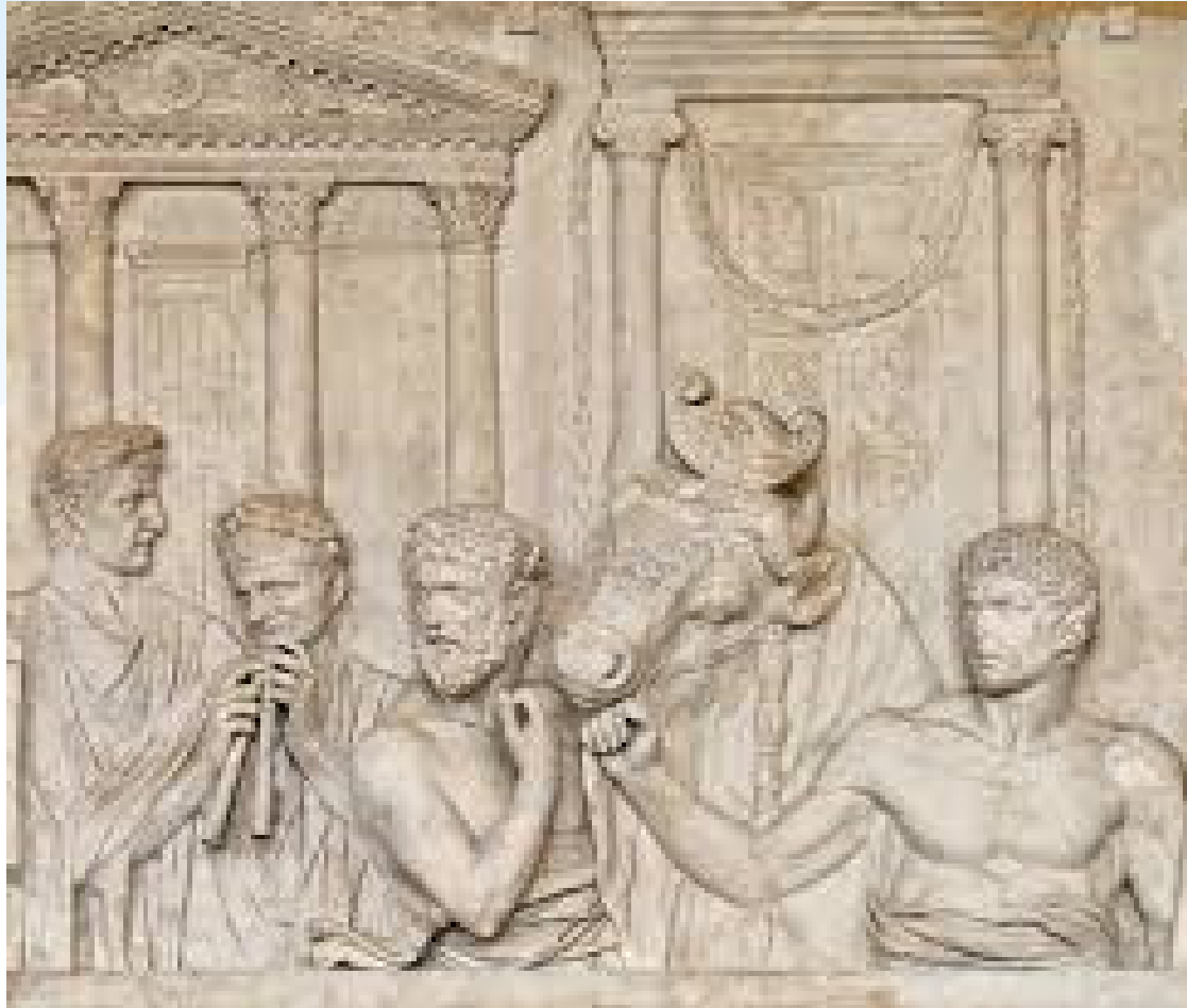
Triumphal March of Jesus the King.