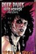
Deep Dives Into Horror