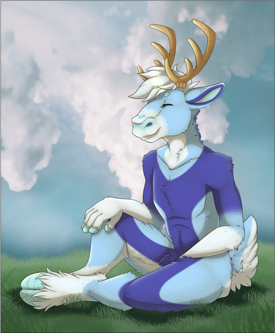
By Scotik Productions