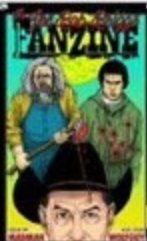
The Joe Bob Briggs Fanzine