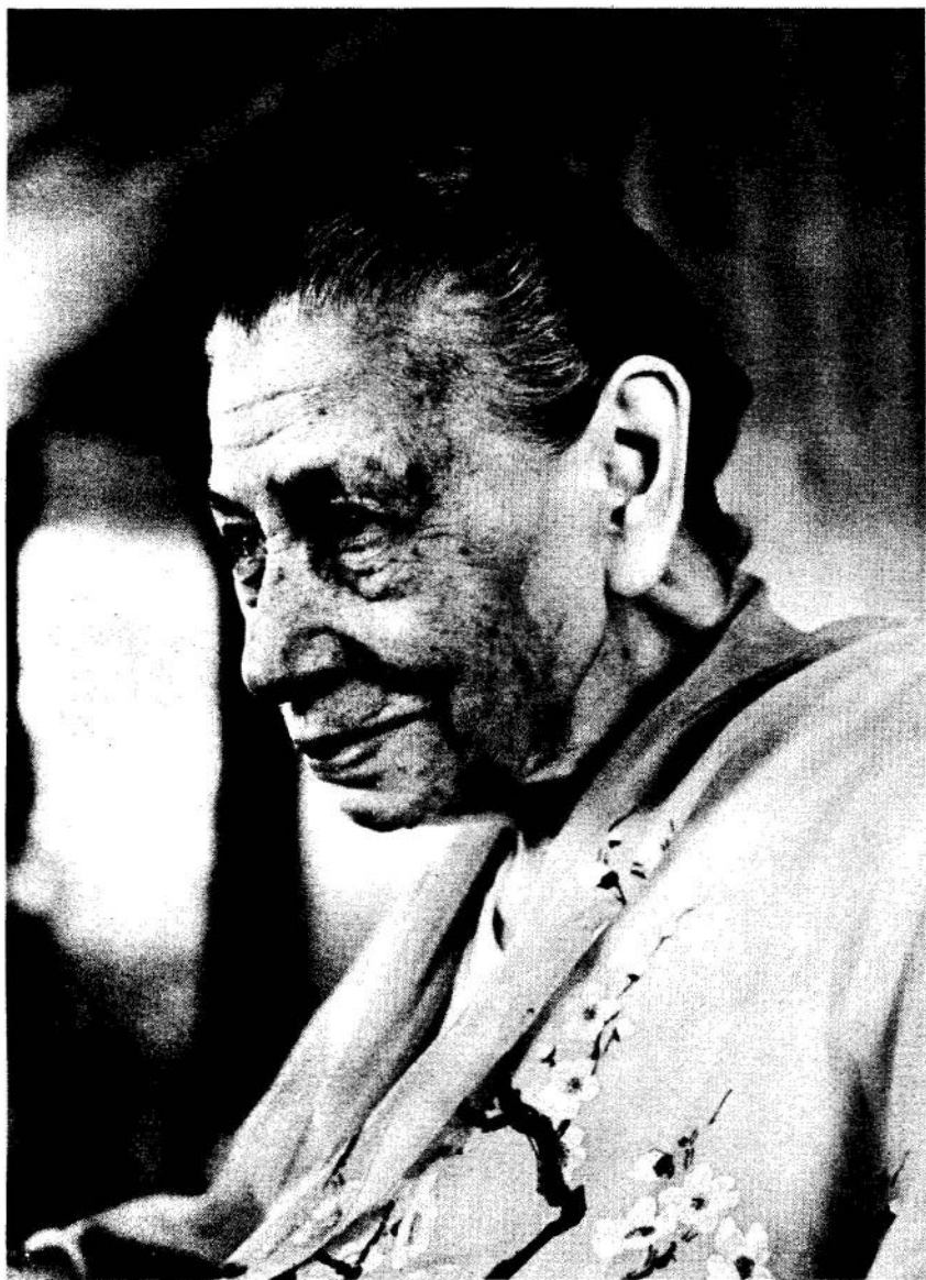
THE MOTHER - 1969